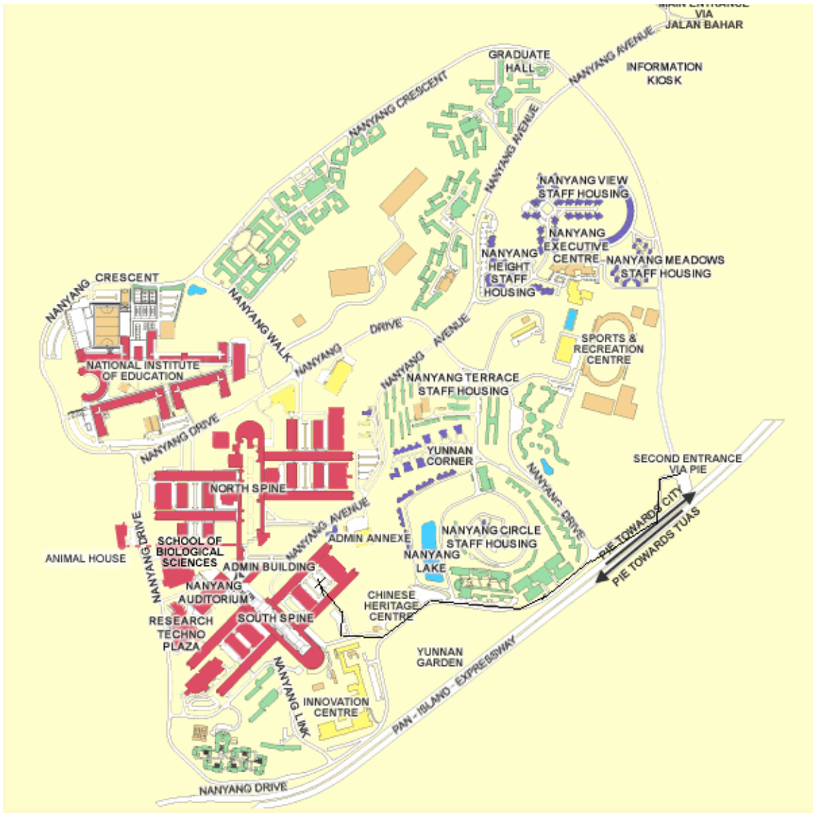
2 nd Entrance from PIE (towards Tuas)